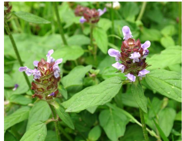
Heal-all ( Prunella vulgaris )