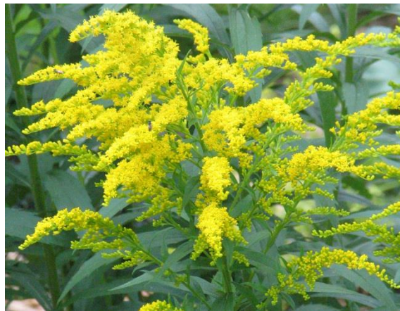
Fragrant goldenrod ( Solidago odora )