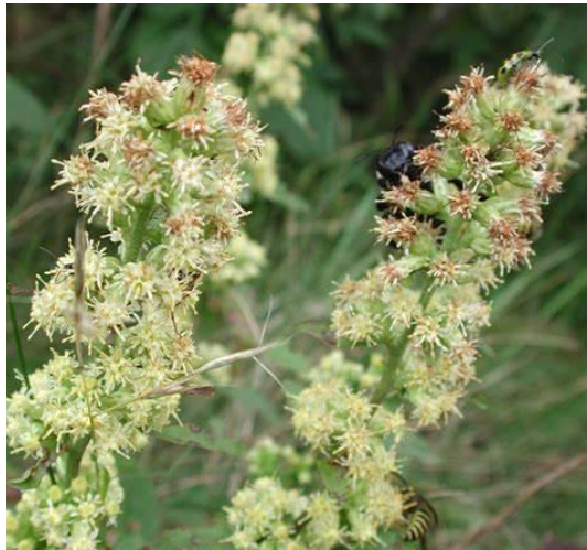
White goldenrod ( Solidago bicolor )