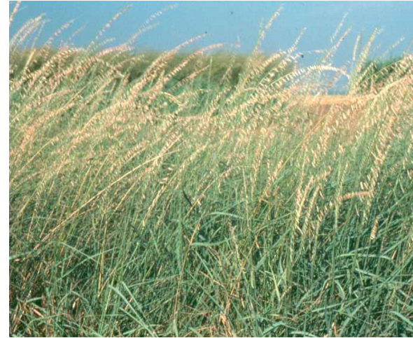
Side-oats grama ( Bouteloua curtipendula )