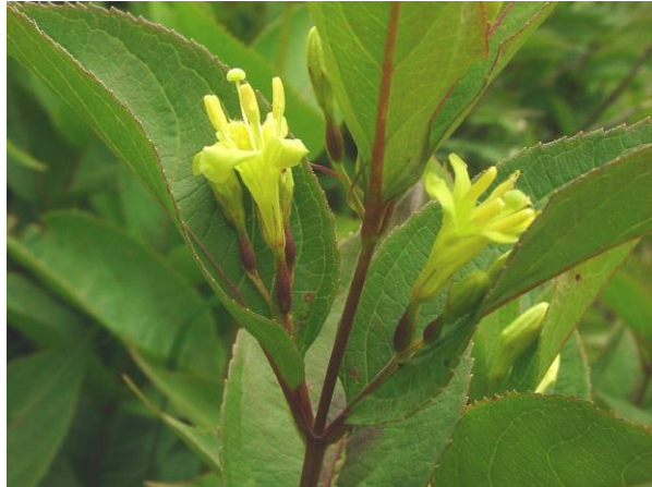
Northern bush honeysuckle ( Lonicera diervillea )