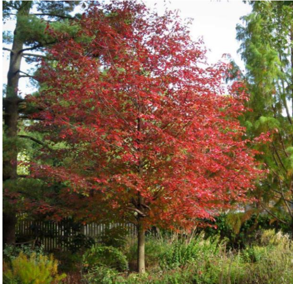
Tupelo ( Nyssa sylvatica )