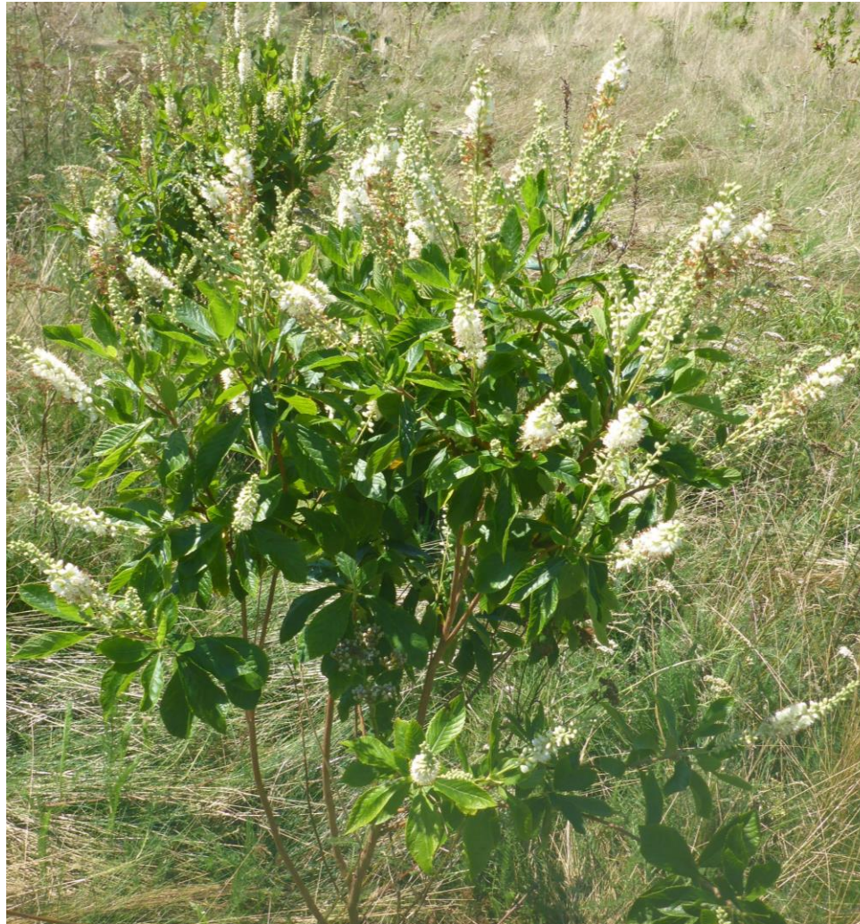
Photo: At CCF meadow on Rt 28

Shrub with spiky blooms in late summer Grows in sun or part shade, average-to-wet soils Straight species is 4-8 ft by 4-6 wide Multiple cultivars available, all pollinator friendly – pink blossoms, smaller sizes Colonizes readily Seeds stay on branch tips all winter