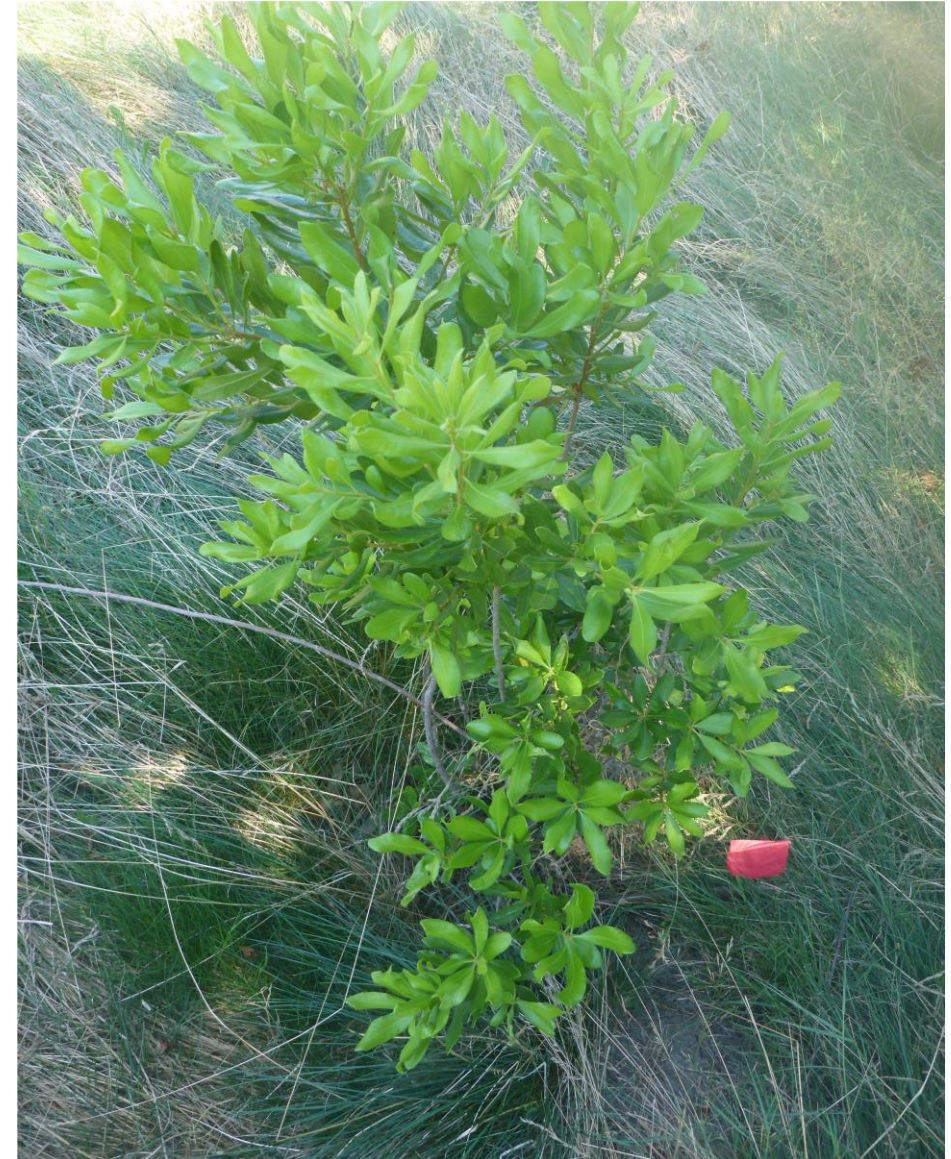
Photo: At CCF meadow on Rt 28

Tough, early-succession shrub Distinctive leaves, berries in the fall Grows in sun and part shade, dry-to-average soil Will colonize and self-seed, but somewhat slowly May be listed as Myrica pensylvanica